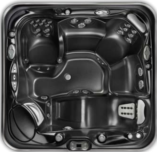
Envoy spa shell shown in Graphite